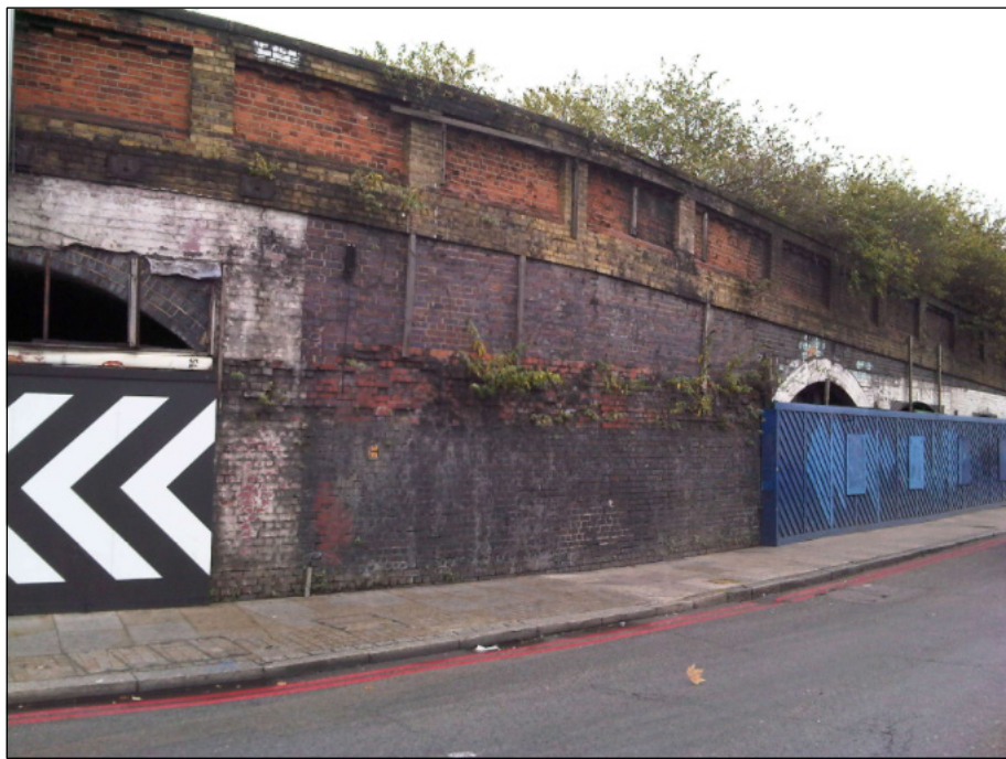
EXISTING BRICK ELEVATION TO COMMERCIAL STREET