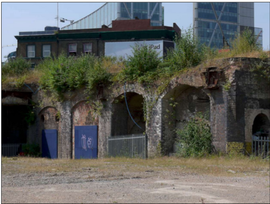
RETAINING WALL ABSENT ABOVE ARCHES ON THE EAST ELEVATION