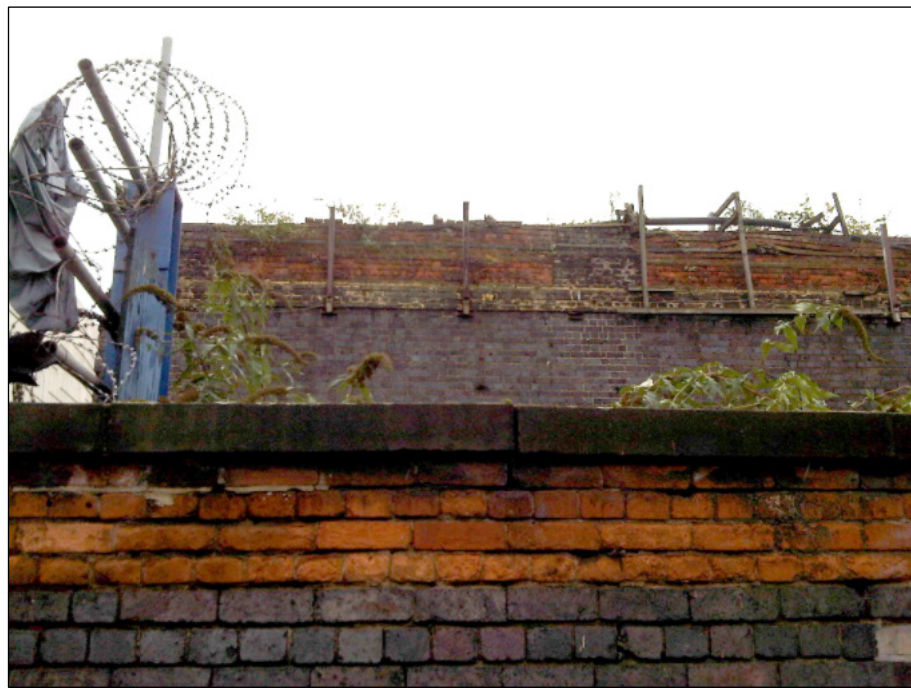
PARTIALLY COLLAPSED BRICK PARAPET TO NORTH END OF THE WEST ELEVATION